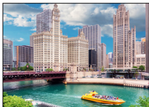
Architectural Boat Tours