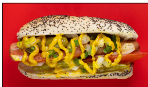
Chicago Style Hot Dog