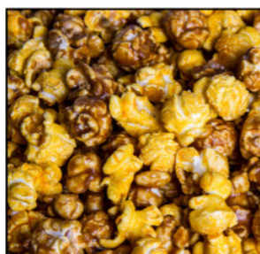
Chicago Mix Popcorn