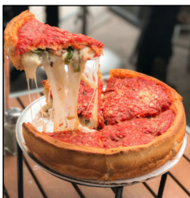
Chicago Style Deep Dish Pizza